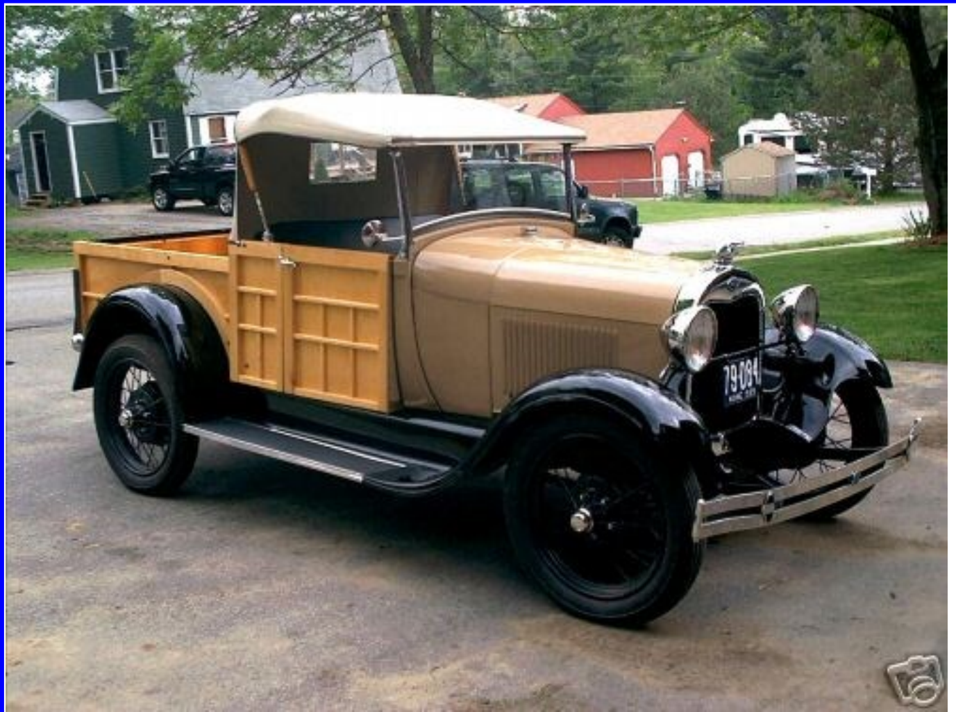
A 1929 Woodie Pickup